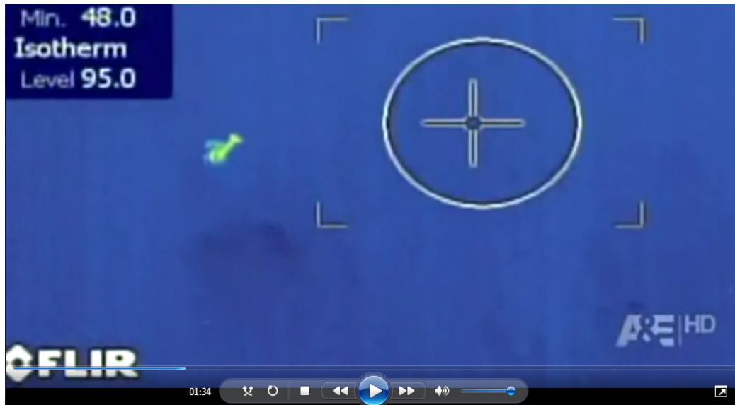
Still Capture from aired film on A&E's Paranormal State